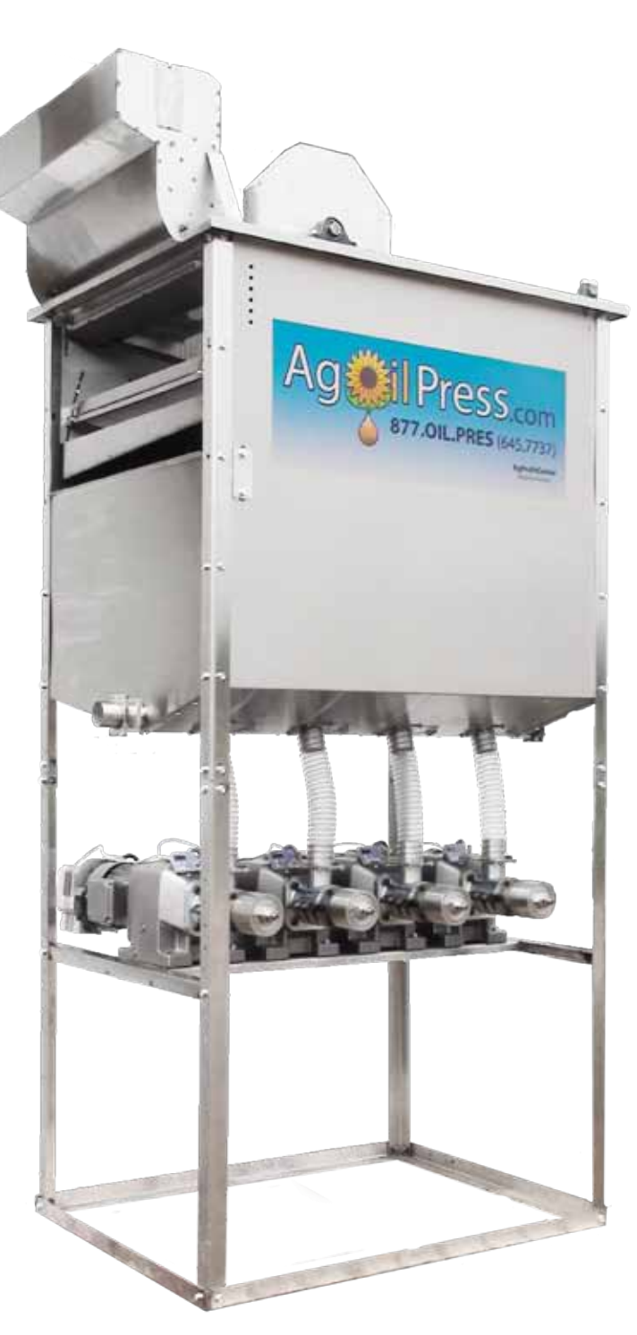
Commodity Cleaner is shown with stand and four M70 Oil Presses attached.